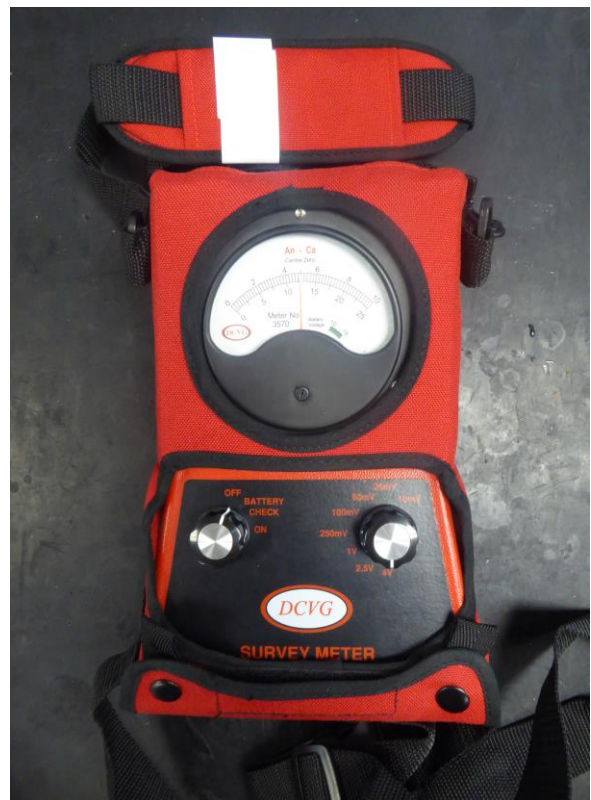
Analogue DCVG Meter with Harness