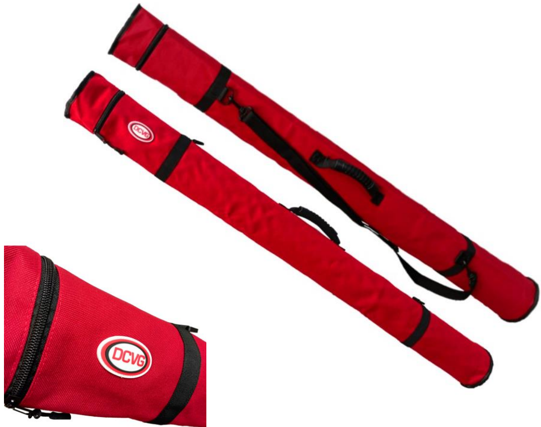
DCVG Reference Probe Carry Case