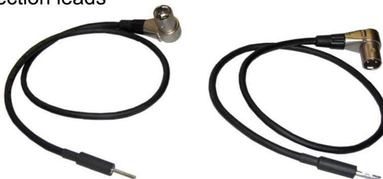
LH & RH Quantum To Probe Handles Connection Leads (also used for DCVG meter to handles)