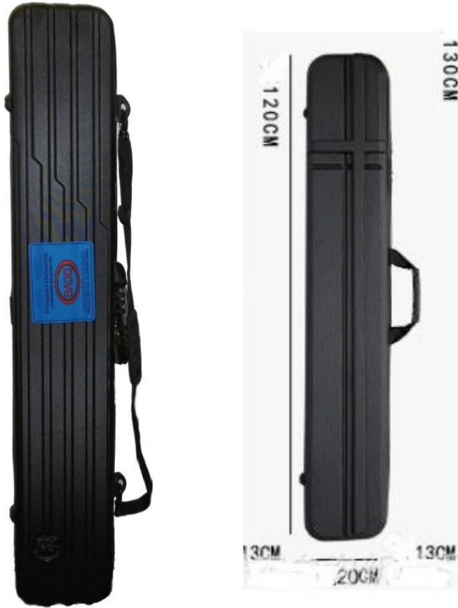
DCVG Reference Probe Carry Case