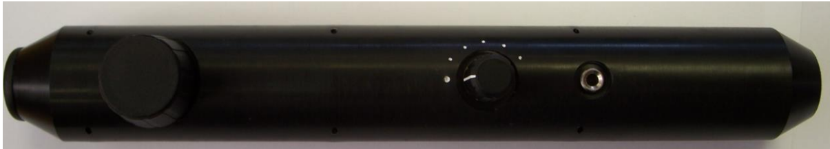
Bias Probe Handles