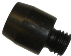
Probe Tip Holder