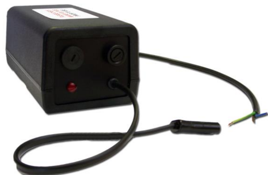
120/240V Batter Charger