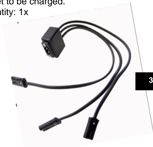
3-Way Battery Charger Adaptor