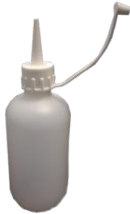
Probe Filler Bottle