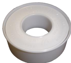
PTFE Sealing Tape