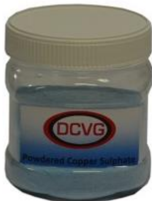
Jar of Copper Sulphate