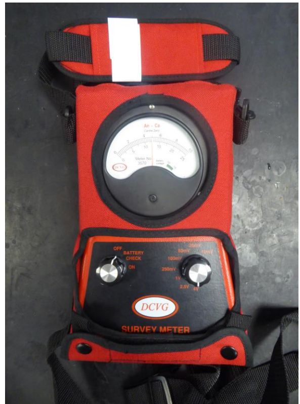
Analogue DCVG Meter with Harness