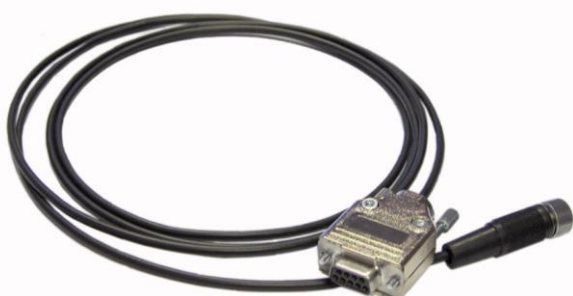
Quantum to RS232 Download Cable