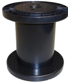
Empty DIN125 Reel