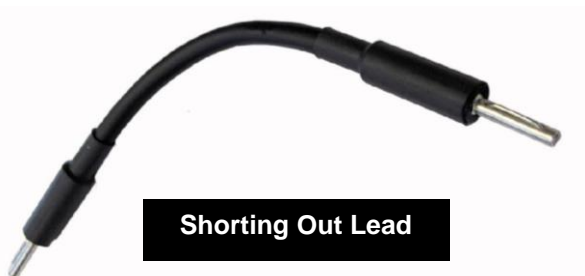
Shorting Out Lead