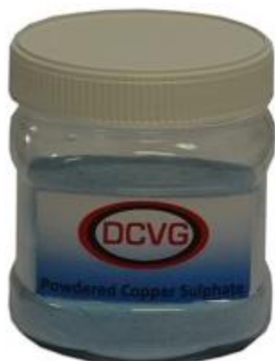
Jar of Copper Sulphate