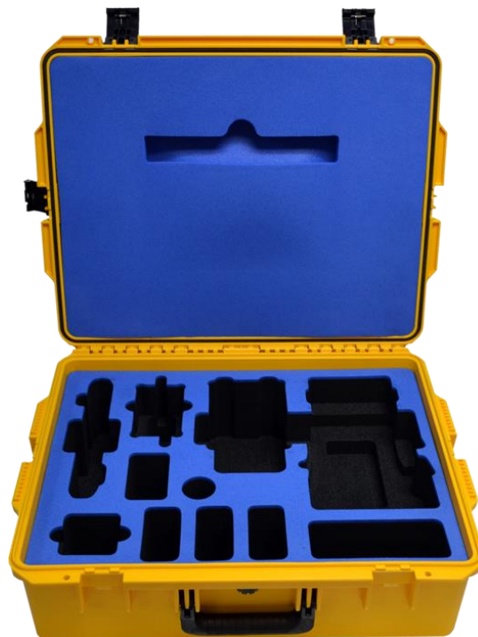
CIPS Carry Case with Blue Insert