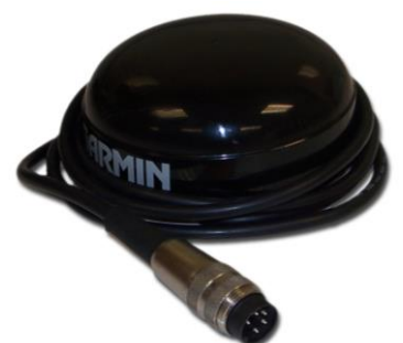
GPS Satellite Aerial