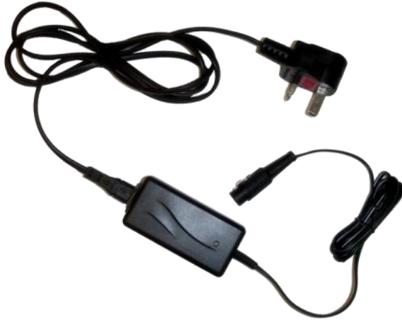
Quantum CIPS/DCVG Backpack Charger