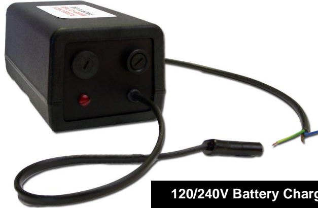
120/240V Battery Charger