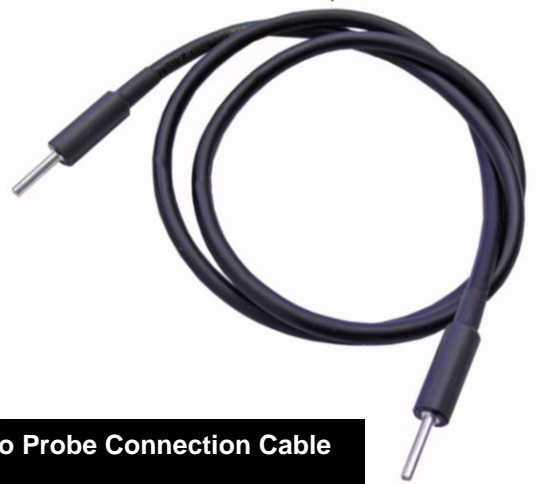
Probe to Probe Connection Cable