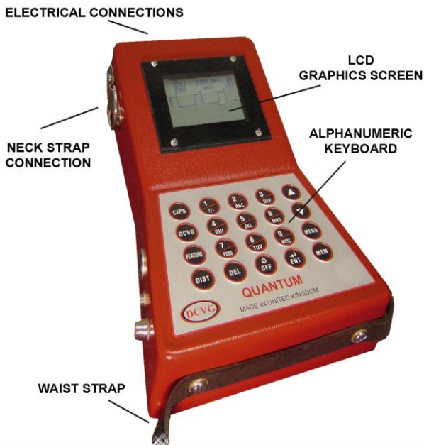
Quantum CIPS Meter -Front Profile