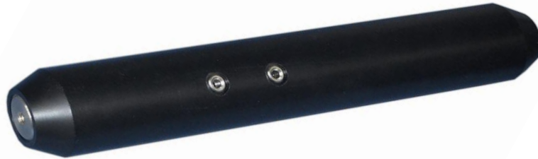
Double Connector Handle