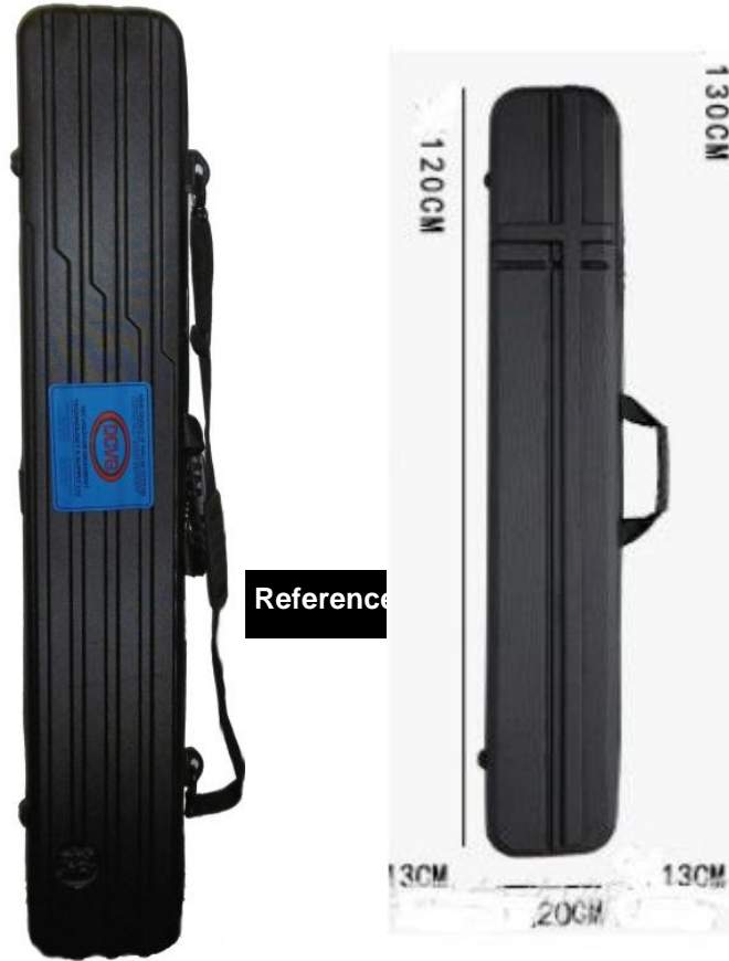
CIPS Reference Probe Carry Case