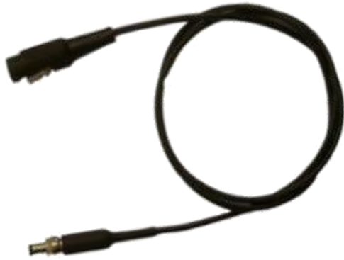
Backpack to Quantum Signal Cable