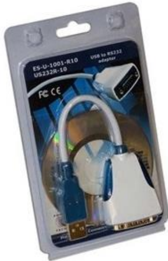
USB to RS232 Adaptor