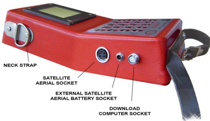
Quantum CIPS Meter -Left Profile