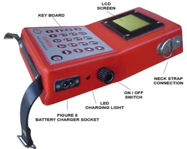
Quantum CIPS Meter -Right Profile