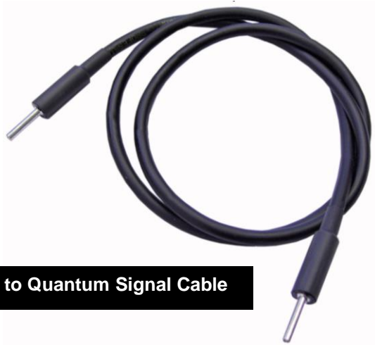
Backpack to Quantum Signal Cable