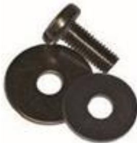
Wire Winding Spindle Bolt Nut & Washers