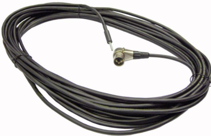
15metre Remote Earth Cable