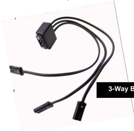
3-Way Battery Charger Adaptor