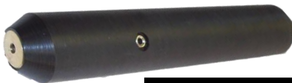
Single Connector Handle